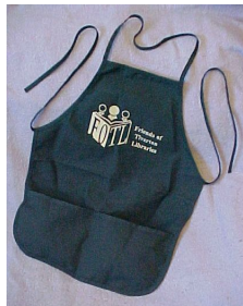
Pocket apron with Friends logo [$12]