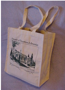
Classic canvas bag with Essex logo [$8]